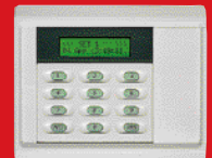
Gardtec 800 Traditional LCD RKP