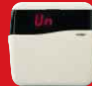
Gardtec Contour LED RKP c/w ACE