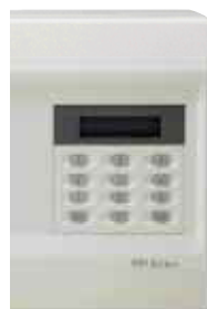
Control Panel with OnBoard Keypad option

A choice of keypad designs, providing robust and attractive alternatives yet offering simple operation means that the system can blend in the environment whilst providing full functionality.