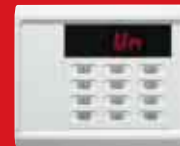
Gardtec 800 Traditional LED RKP