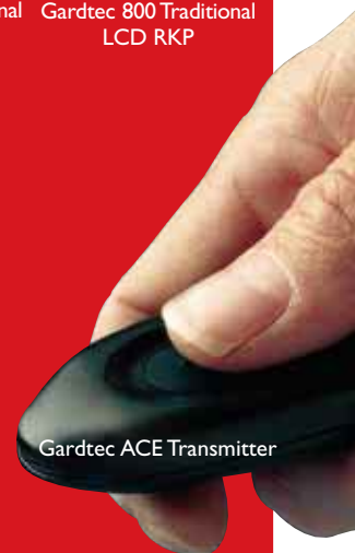
Gardtec ACE Transmitter