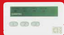
Gardtec ACE Receiver