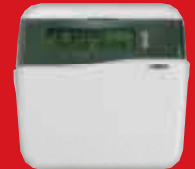
Gardtec Contour LCD RKP c/w ACE